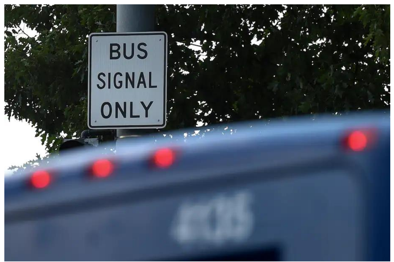
A signal for buses is part of the rapid transit system for CDTA buses on Central Avenue, also known as Route 5, in Colonie, N.Y., on July 14.

The Federal Transit Administration has adopted a broad definition that encompasses projects that upgrade a transportation corridor but do not necessarily have dedicated lanes or roads for the buses.