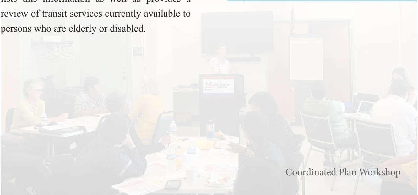
Coordinated Plan Workshop