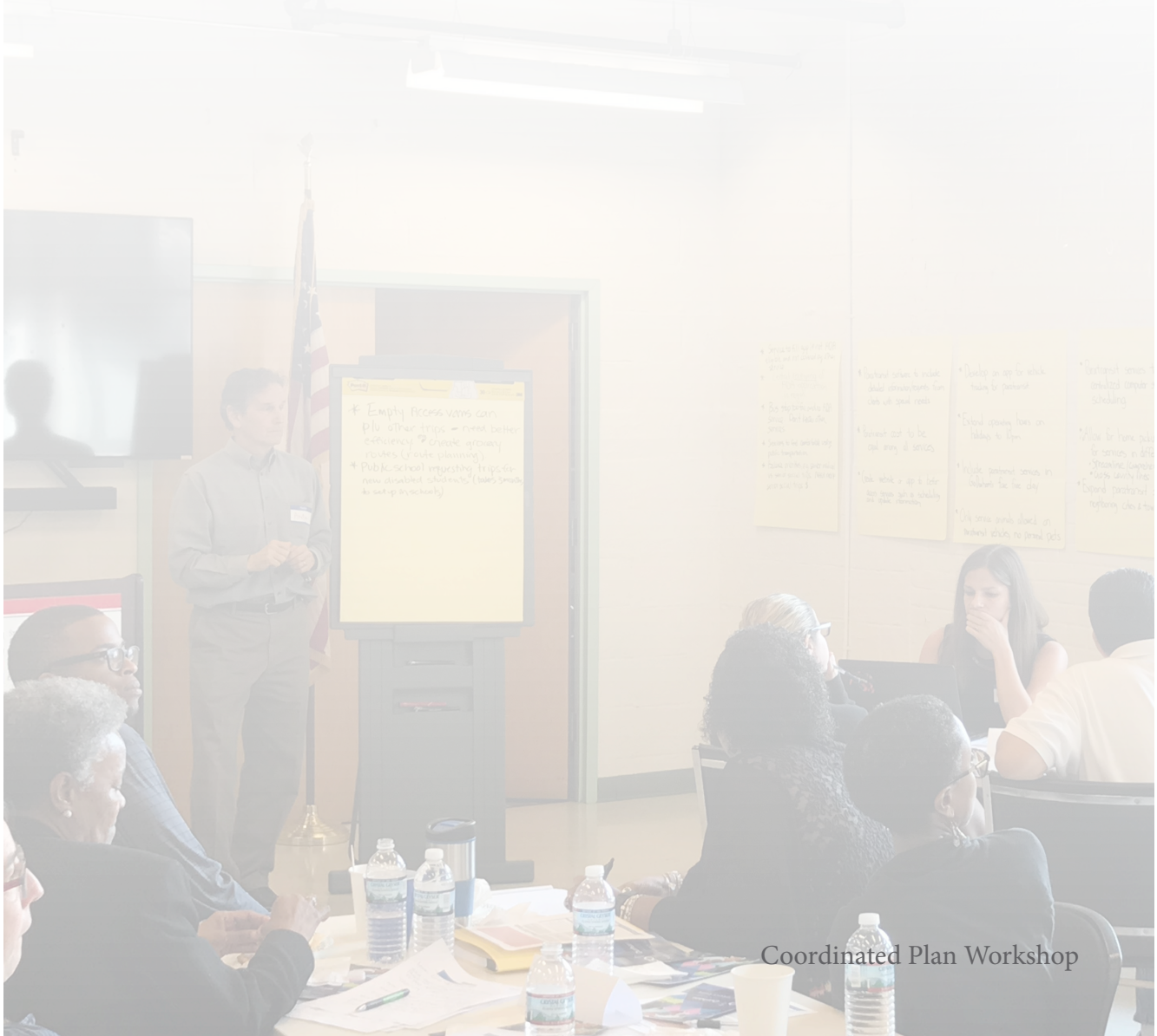
Coordinated Plan Workshop

transportation providers, human service agency representatives, and others in the community. All correspondence encouraged persons to attend the workshops or submit comments directly to MPO staff.