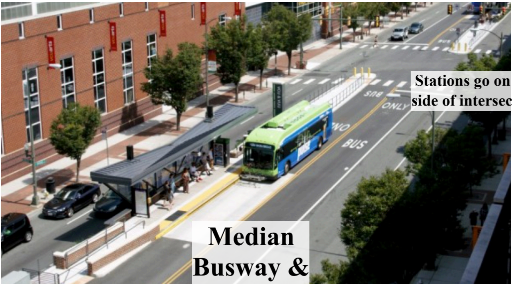
Stations go on far side of intersection