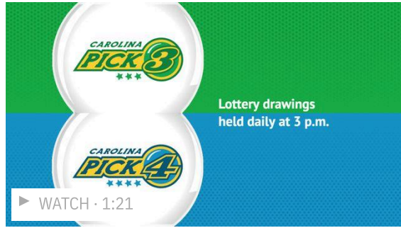
▶ Daytime Pick 3 and Pick 4 Drawing