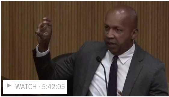
▶ Johnston County Racial Justice Act hearing, March 6, 2024