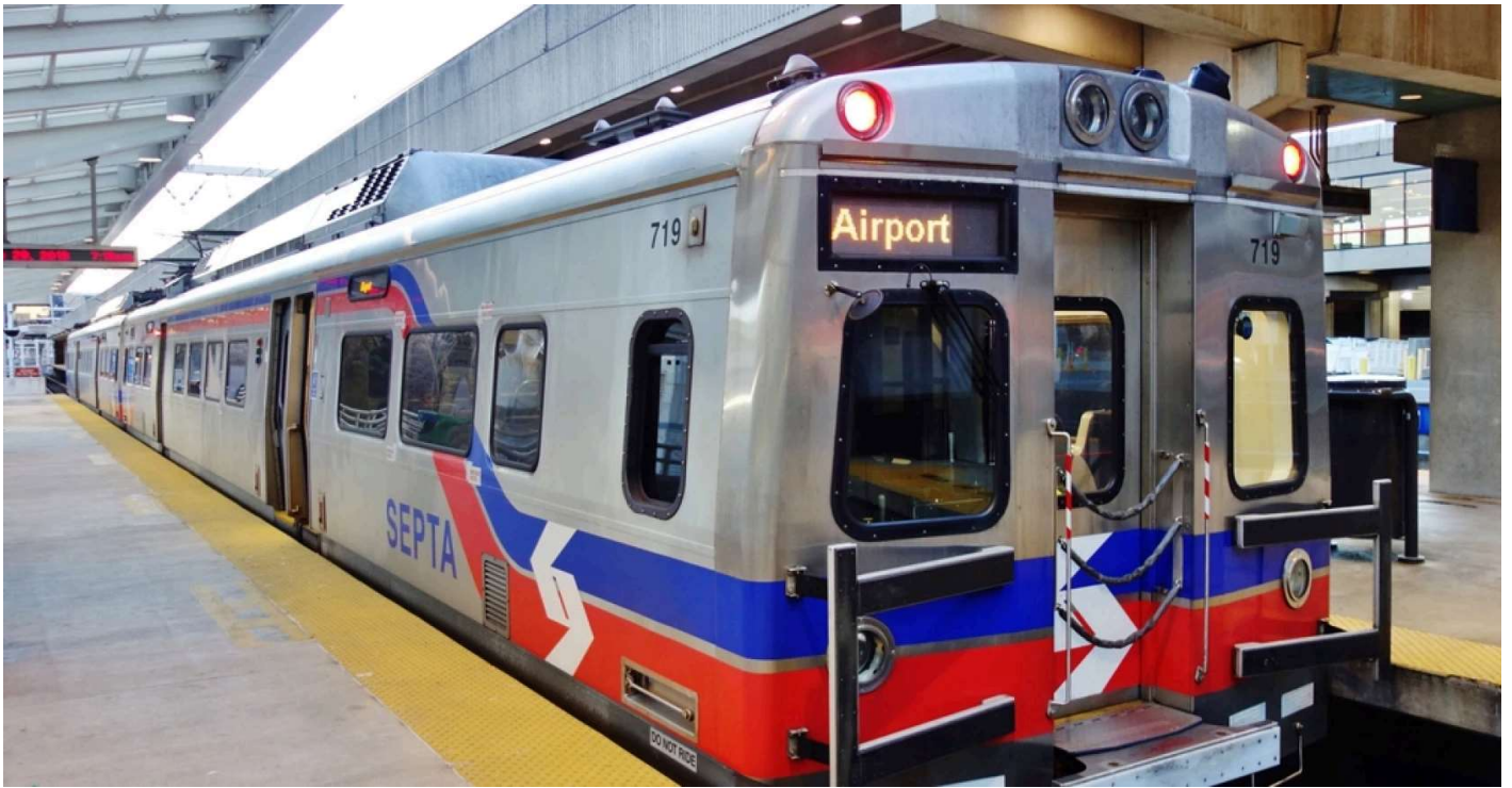
SEPTA, Philadelphia's bus and commuter train system, is running a $240 million deficit.