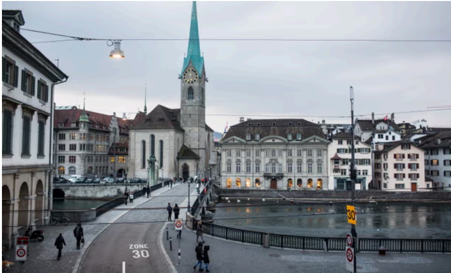
Zurich city centre, where 99.2% of residents live within a 15-minute walk of essential services such as healthcare and education.

Cities such as Zurich and Dublin found to have key services accessible within 15 minutes for more than 95% of residents