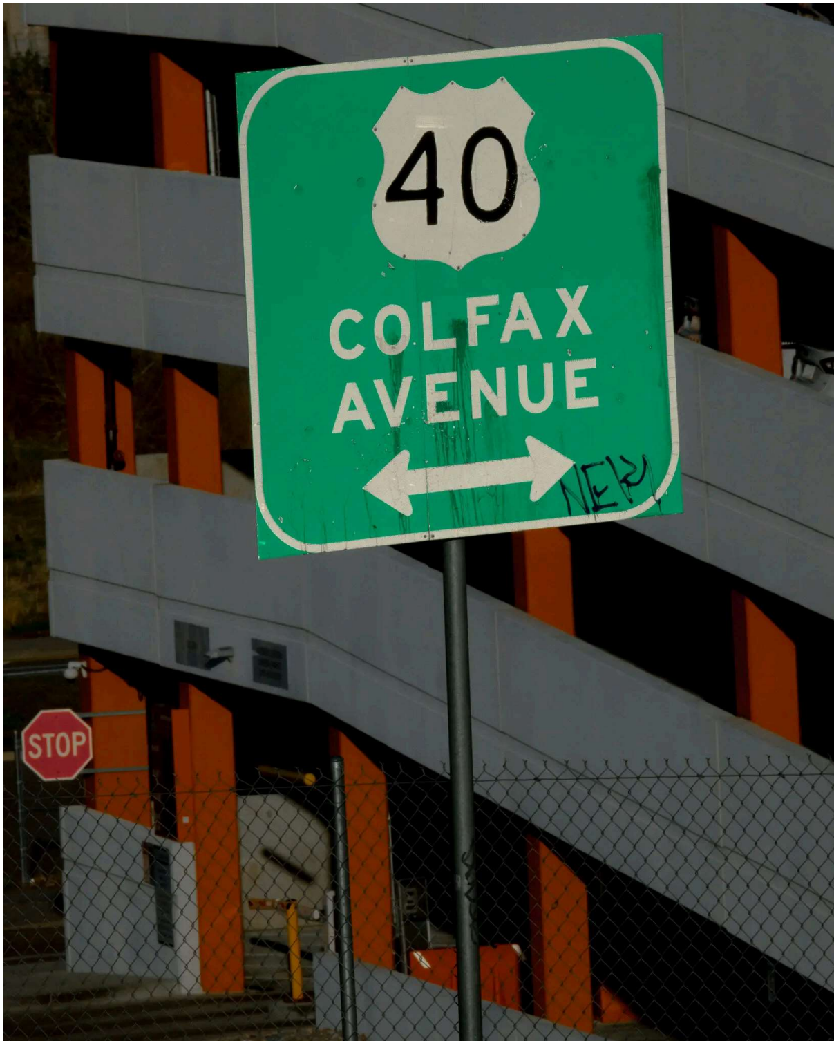
The state and the city are working together to build a bus rapid transit line along Colfax Avenue.

No longer. In 1958, the year that Interstate 25 opened to traffic, the State Highway Department constructed the sweeping interchange connecting Federal Boulevard to Colfax Avenue and demolished more than 240 homes and businesses in the process. That project, which shaped the city for half a century, might now be