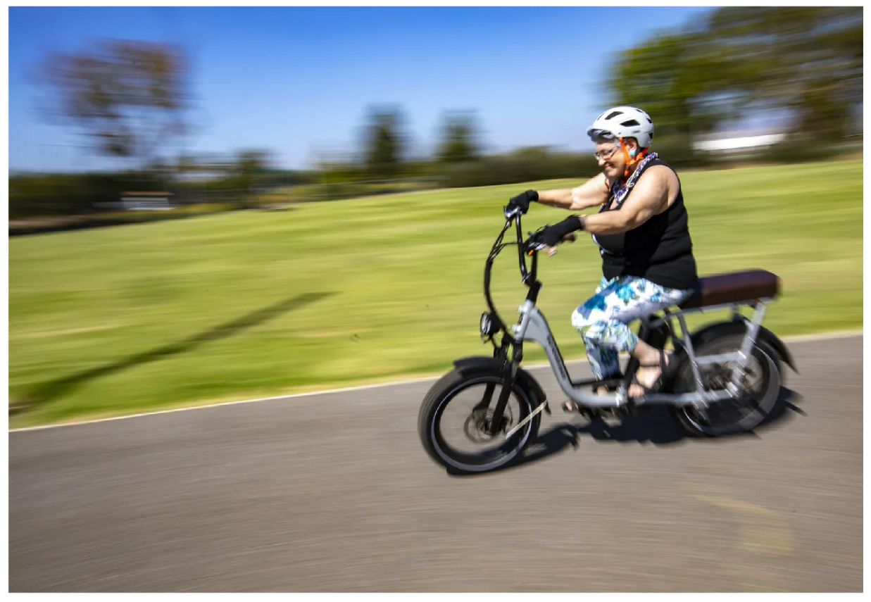
An attendee rides an e-bike at the Electrify Expo in Irvine, California, in 2021.

The program has been the subject of countless local stories as well as much <u>national coverage</u>. It also inspired state and local policymakers from across th country to create their own e-bike initiatives, often modeled on Denver's. Promoters of such rebates see them as a way for cities to move the needle on local transportation emissions, replacing car trips with two-wheeled machine that are healthier as well as less polluting, hastening the arrival of what outlet like National Geographic have called "the future of green transportation."