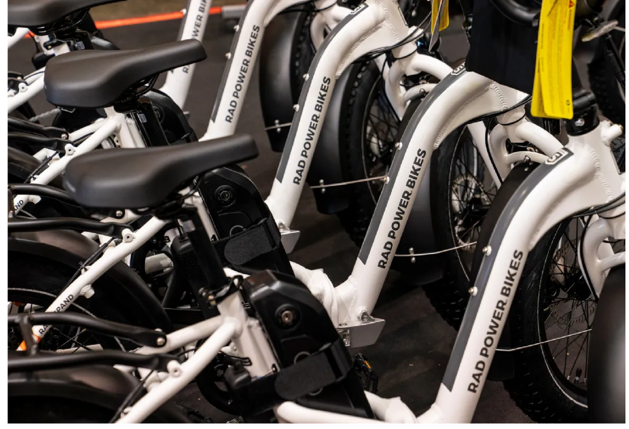
A row of Rad Power e-bikes in 2024. The Seattle company opened retail outlets in Denver after the city's rebate program launched.