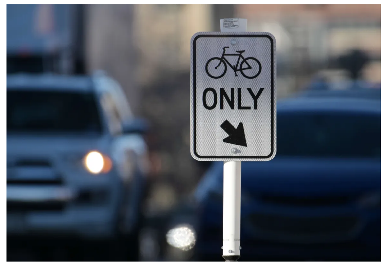
A bike-only sign marks the South Broadway bike lane in Denver, part of the city's new wave of bicycle infrastructure.

Although Denver built <u>137 miles of bike lanes</u> from 2018 to 2023, the network still has significant gaps, a concern Baldwin readily admitted. "In our surveys we hear that a lot – that people would ride more if they felt safer," she said.