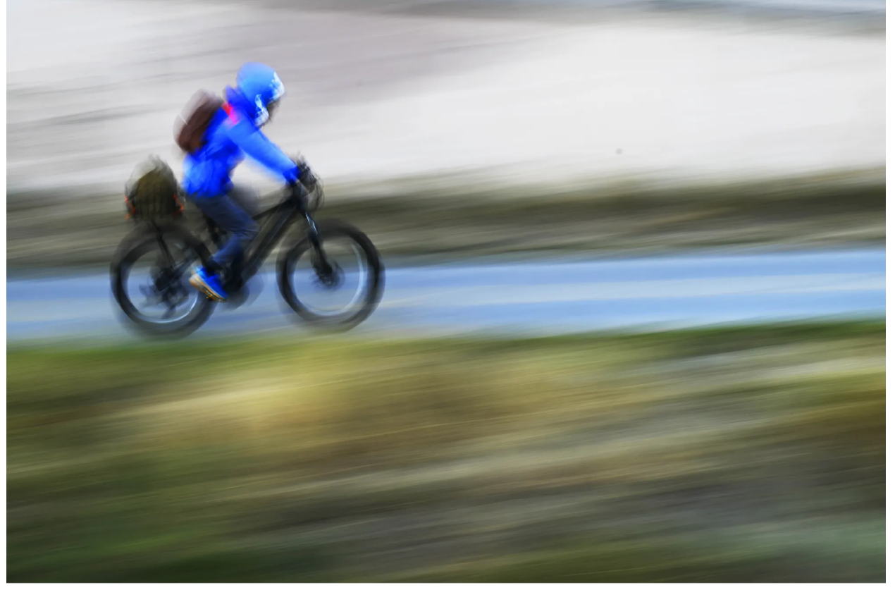
An e-bike rider travels along the bike lane on the Cherry Creek Trail in downtown Denver in 2022.