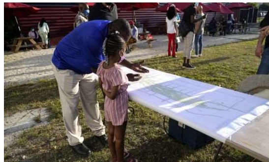
Will Miami's Underdeck Right a Historical Wrong, or Leave Black Residents Behind Again?