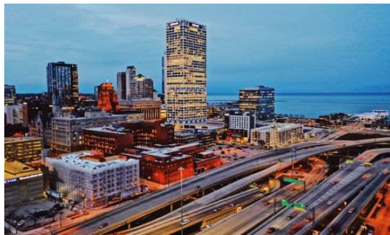
Freeways Blighted Milwaukee's North Side. Can Tearing Them Down Bring New Life To The City?