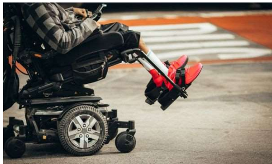
It's Not Just Highways. The Time For Street Reform Is Now.