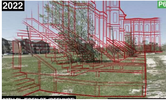
'Segregation By Design' Reveals the Ugly Side of Your City