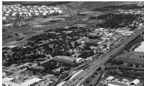
Houston's Disruptive History Of Highways, And What Transit Agencies Can Do Better