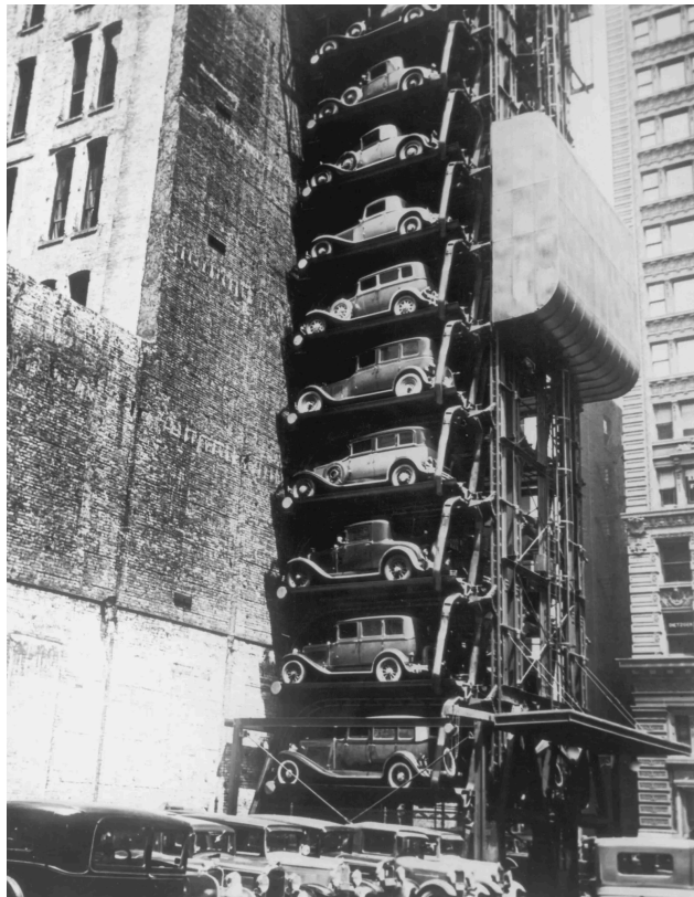
The “vertical parking machine” of 1932 could hold 48 cars.