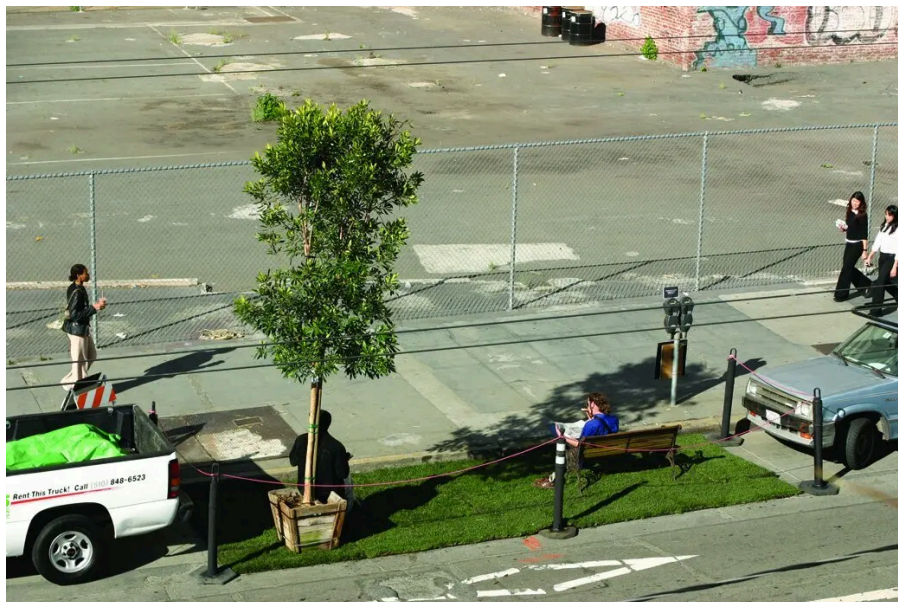
An experiment in finding new uses for curbside parking spaces in San Francisco became a movement. Rebar Group

In 2005, a group of urbanists and activists called Rebar orchestrated an experiment to show people what could happen if cities devoted less space to curbside parking. They decided to transform a single San Francisco curbside parking space into a small park.